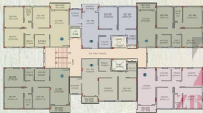
Typical floor plan (Block 9, 11, 12)