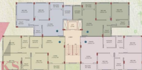
Typical floor plan (Block 13, 14, 15)