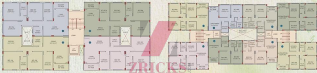
Typical floor plan (Block 1, 2, 5)